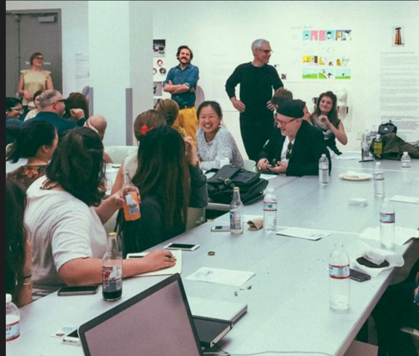
Nike. 'The Future of Skin'

Daniel's guidance marked a turning point. Rather than focus on raw output, he challenged us to examine the core motivations and creative blindspots holding us back. I now approach my work with a more generative lens, welcoming complexity and contradictions as invitations to discovery.