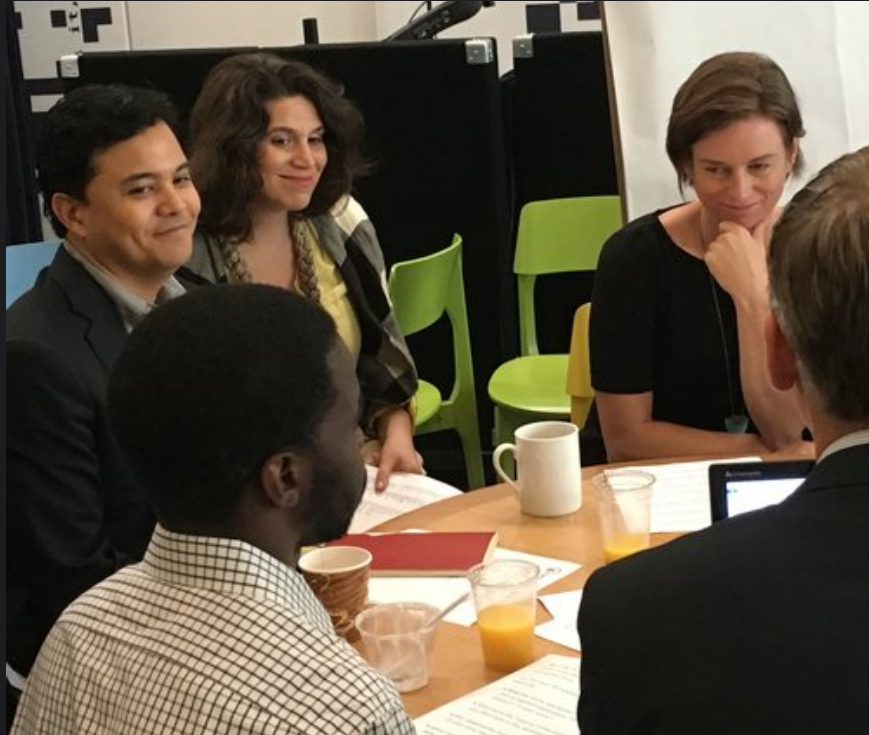
– World Economic Forum, 'Better Problems'